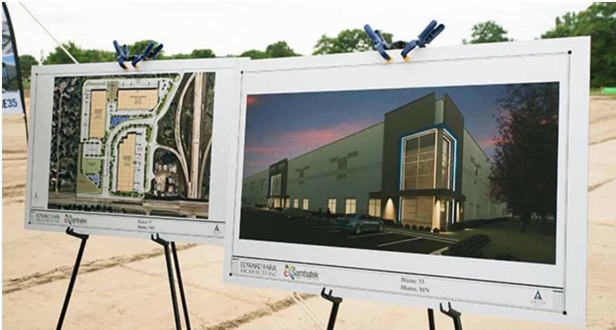
The upcoming 118,500-square-foot industrial building Blaine35, featuring 32-foot clear heights, will rise at the intersection of Interstate 35W and 85th Avenue Northeast in Blaine, CBRE said Wednesday. (Submitted image)